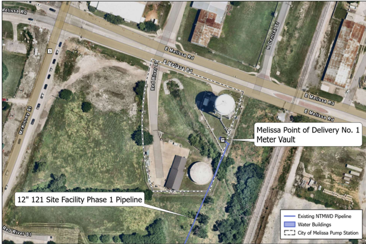
EXHIBIT C POINTS OF DELIVERY